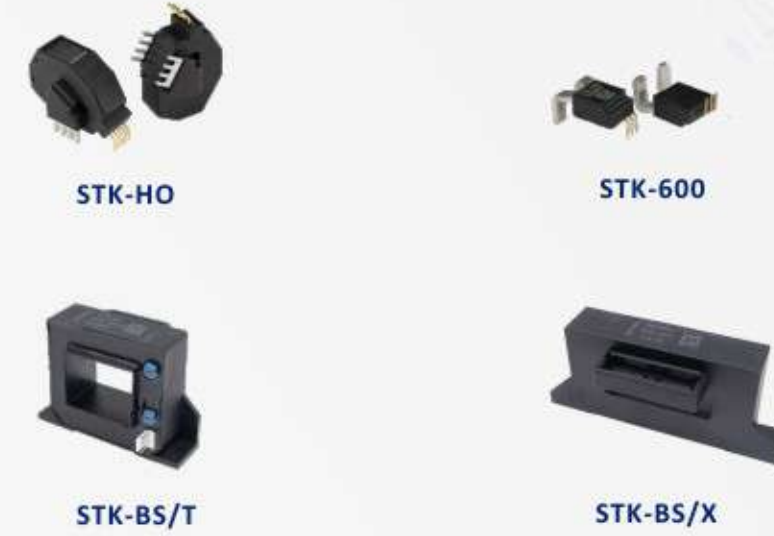
⊙ Isolation & Electrical parameters