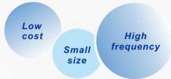
Micro-inverter (Power: 0.5~2 kw)