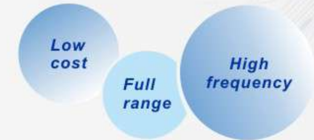
(Static Var Generator) SVG